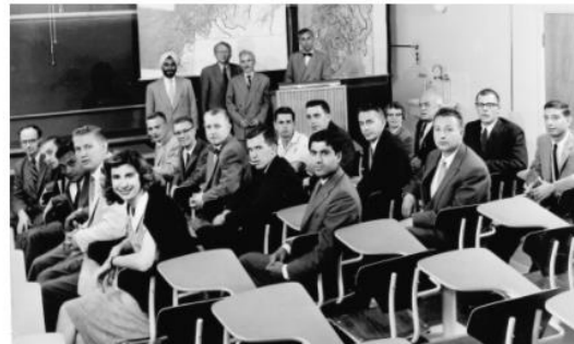
"Industries of Norway" class of 1958 – a course established as a collaboration between ISS and the Norwegian School of Economics and Business Administration.

Looking back at The International Summer School (ISS) on its 75th anniversary, we find that it has served as a central tool for the internationalisation efforts at the University of Oslo through its many decades.