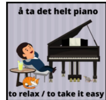
Illustrations shared on Teams by Nermin Al Aly from Egypt, who studies Norwegian at the ISS.

I like idioms because using them gives me the feeling that I'm integrating better with the language and community around me, says Nermin Al Aly from Egypt, who studies Norwegian language at the ISS. —Idioms help me understand the natives better and express myself exactly the way they do. I share my illustrations to encourage others to use them too. Norwegian is not an easy language, but if you love it you can learn it.