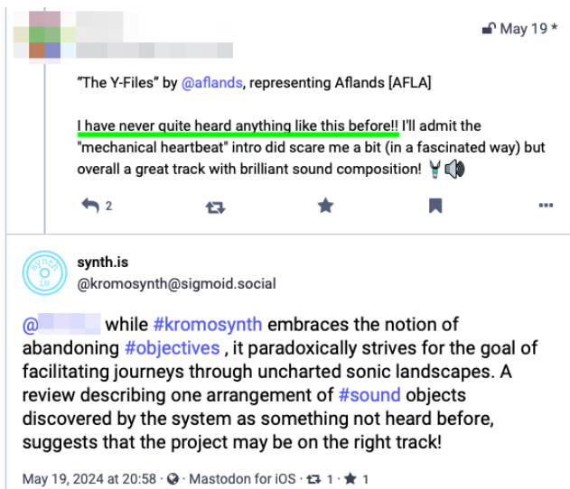
Figure 2: A comment on one manual composition of sounds from our Sound Innovation Engine, and our response.

from those compositions 2 . An independent distribution site—online record store or a digital garden (Basu 2020)—dedicated to sounds organised from those evolutionary processes, has been established at kromo.synth.is (Figure 1). Both stochastic and manual organisations of the discovered sound objects, arranged with the experimental sampler AudioStellar (Garber, Ciccola, and Amusatogui 2021), can be obtained at the site. One of the manually organised pieces was entered into Fedivision 3 , an annual song contest held in the Fediverse (Mansoux and Roscam Abbing 2020). The entry received several interesting comments, such as: "I have never quite heard anything like this before!!" 4 (Figure 2), which indicate a potential for transformation.