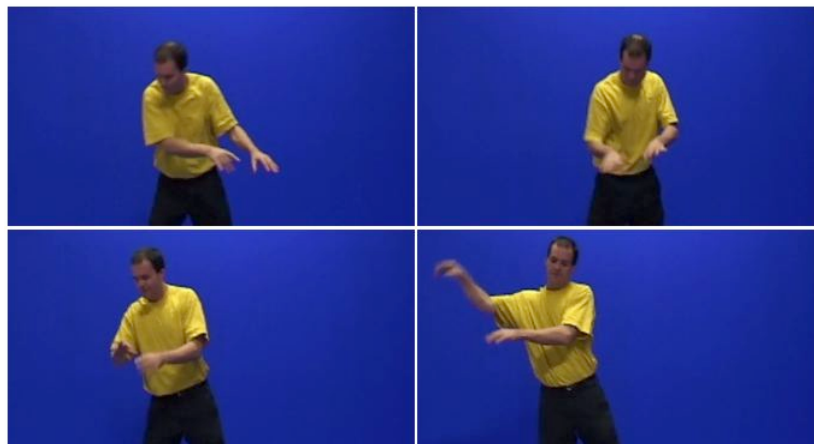
Fig. 1. Air-piano rendering of the opening of Scriabin's 5 th Piano Sonata , here with four key-frames running left to right, top to bottom