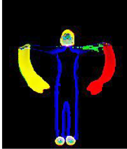
Fig. 3. Gestural rendering of five seconds of sustained sound at the opening of the Lento movement of Ligeti's Ten Pieces for Wind Quintet . The dancer makes a slow upward gesture with the arms, starting from arms aligned with the hips and ending up with the arms stretched out horizontally.

we believe in the future will give us more detail data on the various features in gestural renderings of musical sound. But as a point of method, we believe that we regardless technologies will need to have a conceptual apparatus for understanding what we are observing, something I shall try to present in the following sections of this paper.