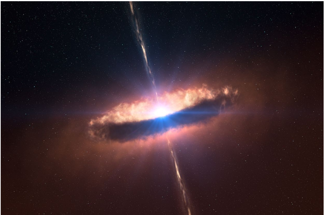
An artistic view of the dusty protoplanetary disk around a massive young star