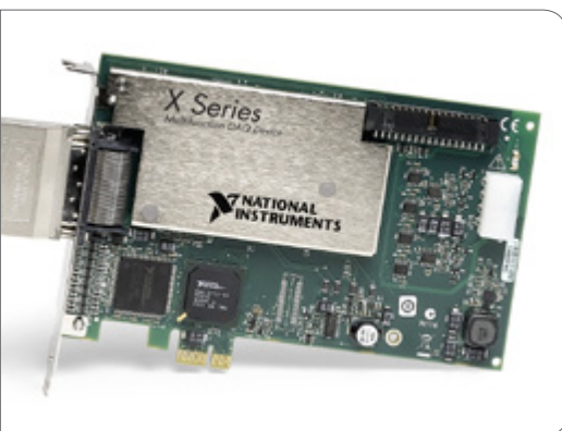
Figure 3. PCI Express X Series Multifunction DAQ

The Peripheral Component Interconnect (PCI) bus is one of the most commonly used internal computer buses today. With a shared bandwidth of 132 MB/s, PCI offers high-speed data streaming and deterministic data transfer for single-point control applications. There are many different DAQ hardware options for PCI, with multifunction I/O boards up to 10 MS/s and up to 18-bit resolution.