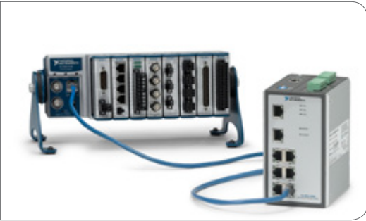
Figure 6. Supporting 100 m per segment and the ability to use existing network infrastructure, Ethernet data acquisition can extend the reach of your measurement system.