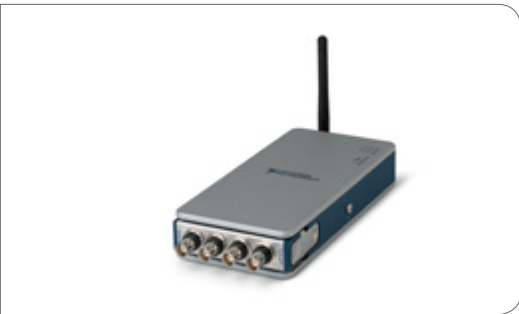
Figure 7. Wi-Fi data acquisition uses standard 802.11 networks to eliminate the need for wires between measurement hardware and the host PC.

Ethernet is the backbone of almost every corporate network in the world and, therefore, is widely available. As a bus for DAQ, Ethernet is ideal for taking portable or distributed measurements at distances beyond the 5 m length of a USB cable. A single Ethernet cable can extend 100 m before needing a hub, switch, or repeater. This distance in combination with a large install base of networks in labs, offices, and manufacturing facilities makes Ethernet an ideal choice for distributing measurements to remote locations. Though available network bandwidth is dependent on the number of networked devices, 100BASE-T (100 Mbit/s) Ethernet can accommodate multiple Ethernet DAQ devices running at full speed. In addition, Gigabit Ethernet (1000BASE-T) can aggregate data from multiple 100BASE-T networks or higher speed devices for larger systems.