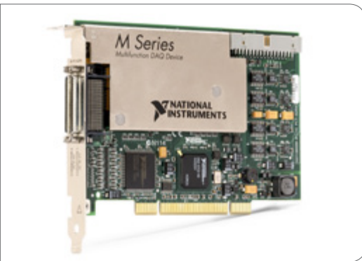
Figure 2. PCI M Series Multifunction DAQ