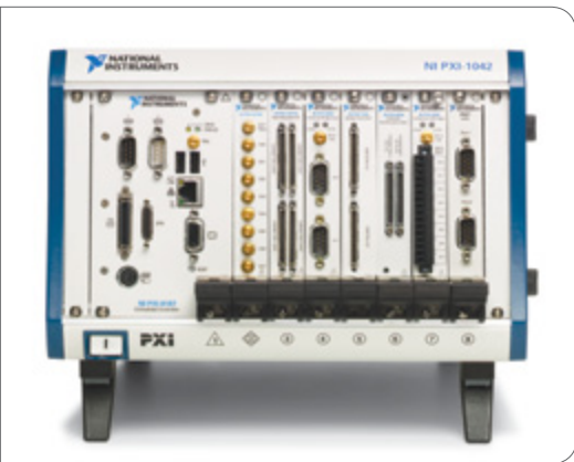
Figure 5. The PXI platform is composed of chassis, controllers, and I/O modules.

On the other hand, the USB bus has several characteristics that make it easier to use than some traditional internal PC buses. Devices that connect using USB are hot-pluggable, so they eliminate the need to shut down the PC to add or remove a device. The bus also has automatic device detection, meaning that users do not have to manually configure their devices after plugging them in. Once the software drivers have been installed, the OS should detect and install the device on its own.