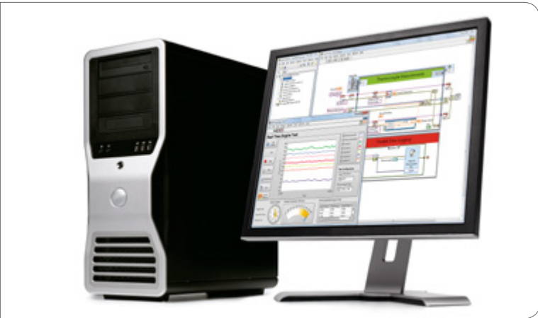
Figure 2. Desktop computers often include the latest PC technology at a reasonable price.

platform; however, the modularity of a PXI system may involve a higher initial cost than a laptop or desktop with USB instrumentation. That being said, choosing a PXI system upfront could save time and money in the future as your instrumentation needs change.