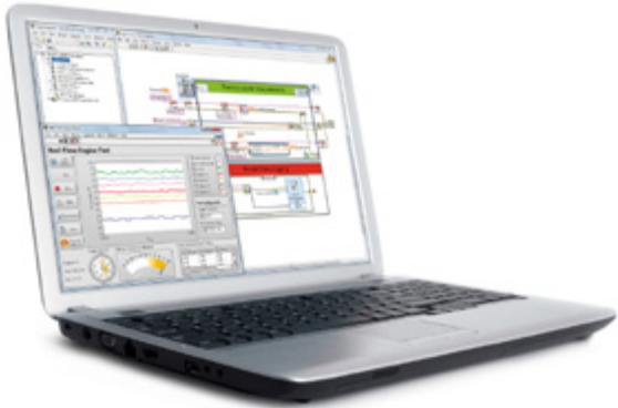
Figure 4. You can use lightweight, portable laptop computers to acquire data in the field.