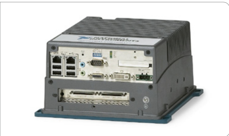
Figure 3. Industrial computers feature all of the components of a standard PC with a rugged mechanical design.

A desktop computer is a PC intended for regular use at a single location. Desktop computers are typically used in offices, labs, or anywhere that is not an extremely harsh environment. These computers consist of a few parts: a monitor, a keyboard, a mouse, and the computer itself. Since there are so many parts to a desktop computer, you do not want to repeatedly move it to different locations. However, because desktop computers are larger, they can dissipate more heat, allowing them to house larger, more powerful processors. Therefore, the biggest attribute of the desktop computer is the processing power. If you need to analyze data or log data to disk at fast rates, but you don't require mobility, the desktop computer may be exactly what you need for your application.