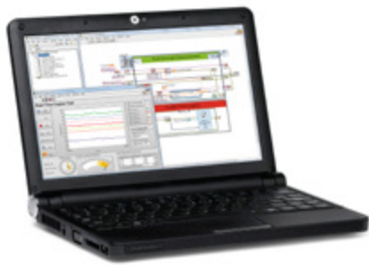
Figure 5. Netbooks sacrifice processing power, but offer lower cost and smaller size.

A laptop computer is a PC intended for mobile use. Because of their size, laptops are typically used with portable measurement systems. All of the parts are housed together in one laptop, making it very easy to move it from place to place. A laptop gives you the freedom to monitor different applications at multiple locations with ease. But since all of the parts are together in one unit, you need to make sure the environment you expose the laptop to is not going to damage it. For instance, most laptops may not be rated for dust or moisture. If you are looking for a portable, general-purpose computer with the ability to analyze and store data, a laptop computer may meet your needs.