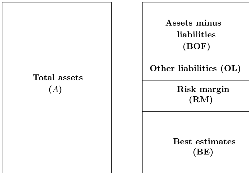
Figure 1 The Solvency II balance sheet of an insurance company with assets (left) and liabilities (right).

The complexity of liability valuation is reflected on the right in Figure 1 with the three main Solvency II components. The largest of them in practice is the so-called Best Estimates (BE) at the bottom right which is the expected values of all future cash flows out of and into accounts under existing contracts. ‘Expected’ should be interpreted in a mathematical sense, and is in principle an expectation under some underlying stochastic model; more on that later. Future premia are included as are reinsurance compensations, and both are subtracted the amounts needed to liquidate claims and cover expenses so that that BE is an expected, net obligation. It makes use of market risk-free interest rates for discounting which means that future fluctuations in A on the left in Figure 1 are not independent from those in BE; more in Section 2.4.