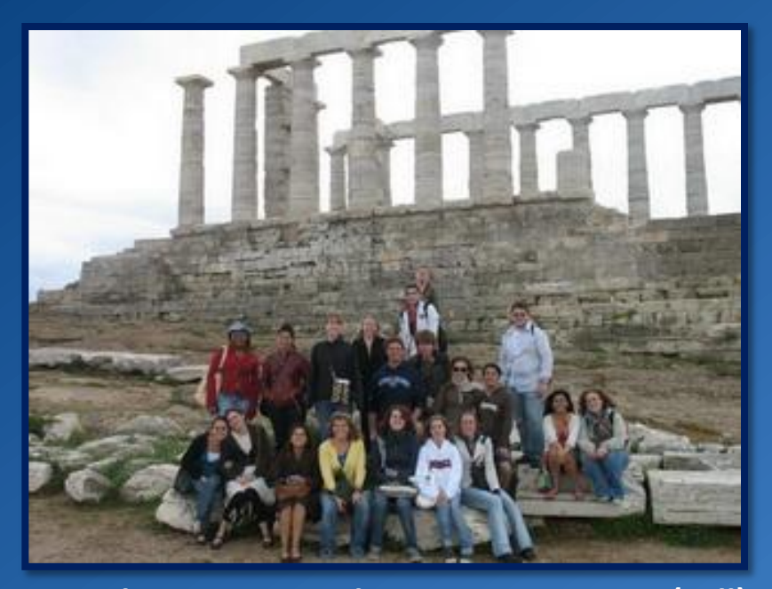
Travel to Bosnia, Serbia, Croatia, Vienna (Fall) or to Cyprus, Greece, Turkey (Spring)

Investigate the dynamics and modalities of deep-rooted international and identity conflicts.